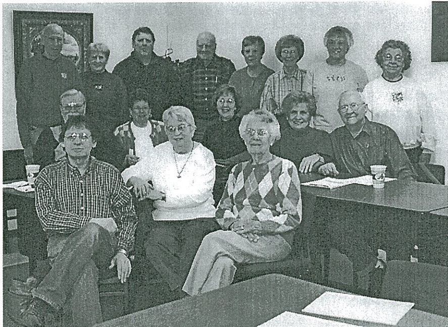
Chapter members who contributed Mania Bucks